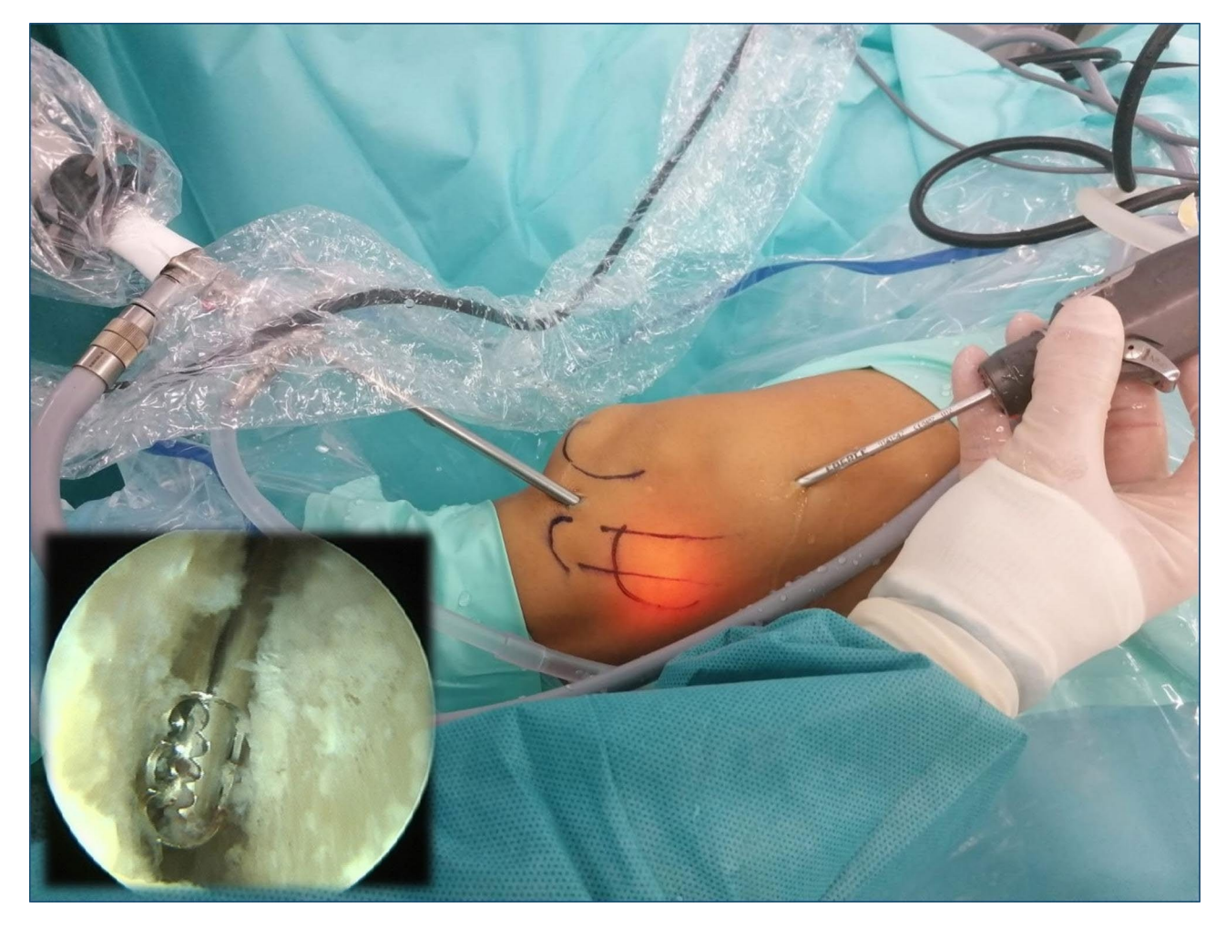
Fig. 4 Intraoperative image. Release of the fibrous adhesions in the space between the LFC and ITB using a motorized shaver

of the ITB, the tenotomies were also made transversely in the posterior third (Fig. 6).