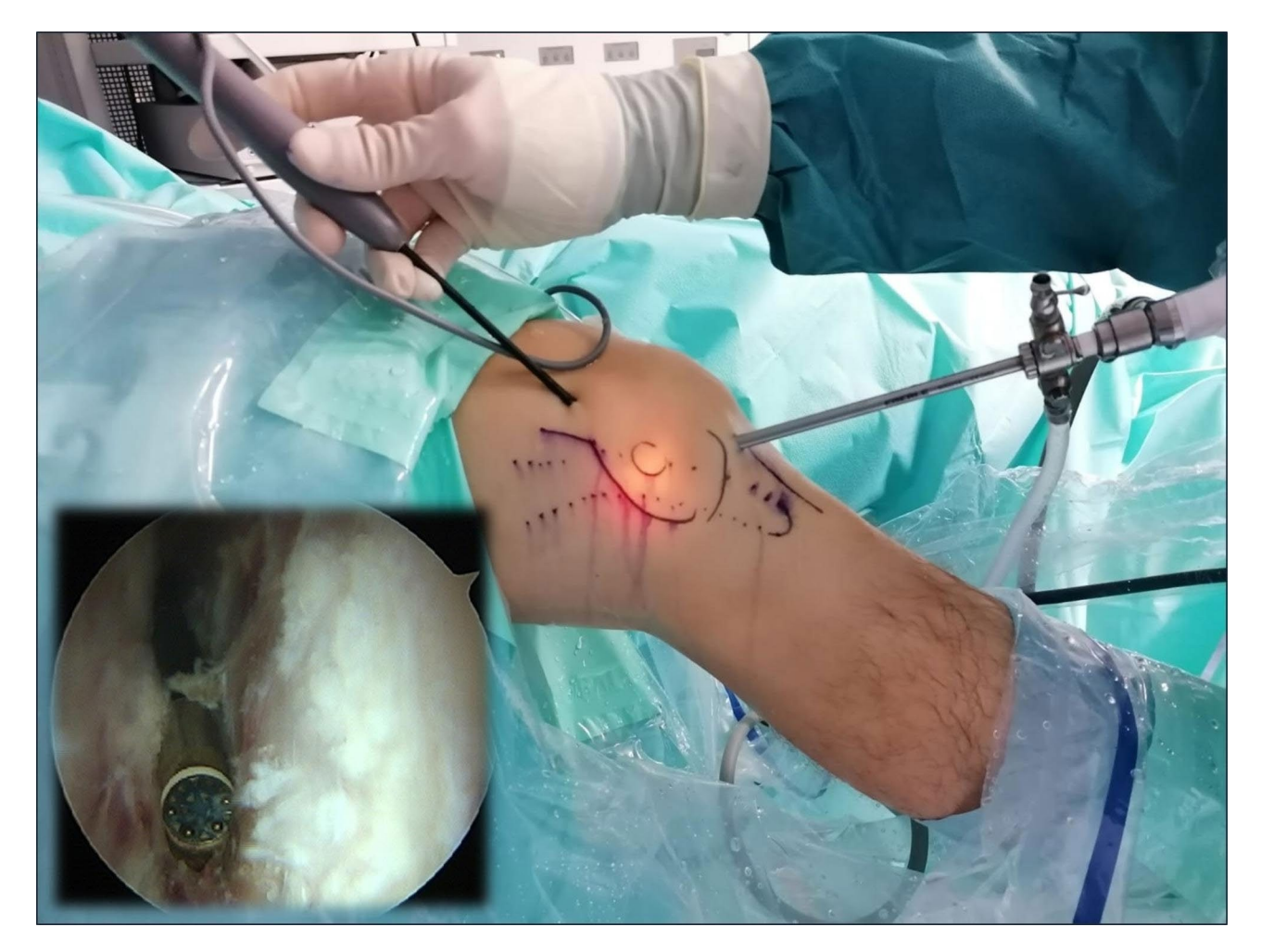
Fig. 5 Intraoperative image. Release of the fibrous adhesions in the space between the LFC and ITB using a vaporizer

days, 1, 3, 6 and 12 months, and at the end of follow-up (medical discharge). Complications and clinical course were assessed at all visits, while the sporting performance and the ARS and IKDC questionnaires were assessed at 3, 6 and 12 months, without access to a copy of the scales during the interim period, in order to prevent patient self-monitoring of recovery and influencing the final outcome. The degree of satisfaction was recorded at the last follow-up visit.