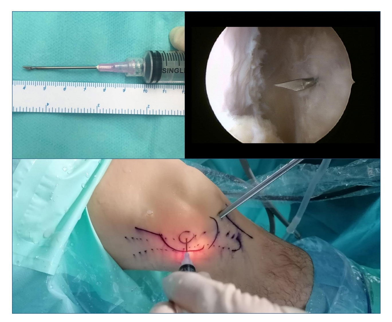
Fig. 6 Intraoperative image. Micro-tenotomies on the ITB by an 18G 3-mm needle scalpel