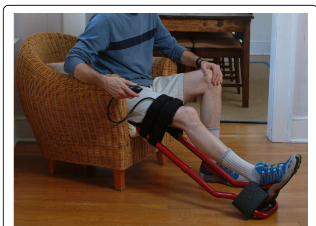
Figure 1 High-intensity stretch mechanical therapy device used in this study. The ERMI Knee Extensionater (r) was used as an adjunct to physical therapy for patients with knee flexion contractures.

Of the two osteoarthritis patients treated with the HIS device, one demonstrated apparently long lasting improvements passive knee extension ( 10^\circ improvement at 21 months). The other OA patient began HIS treatment with a 6^\circ flexion contracture and did not demonstrate any improvement in passive knee extension ( 0^\circ change). There were three other patients that