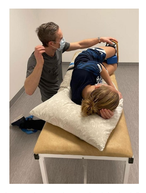
Fig. 1 The set-up when testing hip strength with the Clamshell test

The combined hip abductor and external rotation strength was measured with a handheld dynamometer (MicroFET2TM wireless, Hoggan Scientific, LLC. USA) with the player performing an isometric clamshell