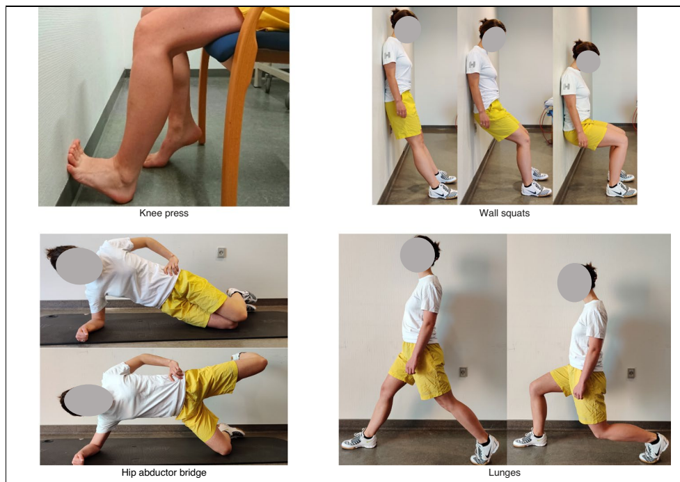
Fig. 1 Depiction of hip- and knee exercises