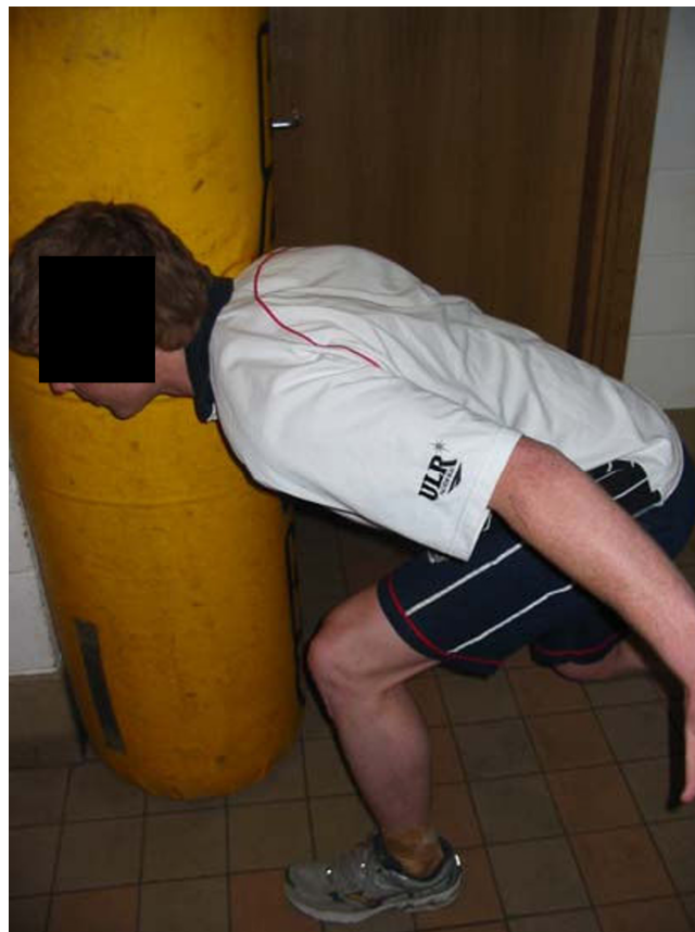
Figure 2 Foot and body position at contact.

Data were analysed using the statistical software package SPSS (version 12). Differences in time of onset between muscles were analysed with a factorial ANOVA with two factors (side (left or right) and muscle). The critical alpha level chosen \alpha = 0.05 for all analysis. Paired t-tests were used to evaluate specific differences found (corrected for family-wise inflation of type 1 error with Bonferroni corrections). In order to assess the test-retest reliability of the muscle onset timing, the second and the fifth repetition for each subject for all muscles was compared using intra-class correlation coefficient (ICC) to assess both the