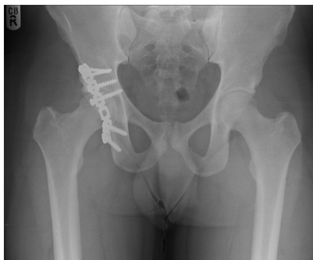
Figure 3 One year follow up radiograph.

In sports, hip subluxation is more common than dislocation indicating the lesser energy involved compared to motor vehicle accidents [6]. The common mechanism in motor vehicle accidents is due to knee hitting the dashboard with the leg in adducted and flexed position leading to a posteriorly directed force on the hip [7]. Letournel and Judet [8] have shown that the posterior acetabulum rim bears the impact of the femoral head with this leg position. The characteristic fractured acetabular posterior lip confirms the force vector and pathomechanism of injury. The indentation of the femoral head also reaffirms this mechanism. With traumatic hip dislocation, prompt reduction is of paramount importance in order to