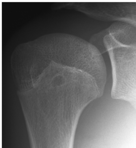
Figure 4 An anteroposterior plain radiograph (2009-3-31) shows the lesion had been totally healed.