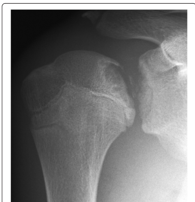
Figure 1 An anteroposterior plain radiograph (2007-5-25) shows the lesion became larger and a sclerotic band appeared around the lesion.

These findings confirmed the diagnosis of osteonecrosis. Still the patient was not permitted to perform any sport activities. On December 25, 2007, new MRI scans revealed that the lesion had become even smaller and there was only a low signal band left on several slices in the coronal oblique view. On June 30, 2008, the healing progressed even further, and abnormal signal had disappeared on all but 2 slices, on which only a thin and vague low signal line could be observed on the posteromedial subchondral area (Figure 3). Because the healing process was almost completed, the patient was permitted to start swimming in a gradual manner. On the latest visit of March 31, 2009, the lesion was totally healed with normal appearance on plain radiograph (Figure 4). There was no pain and the range of motion was full.