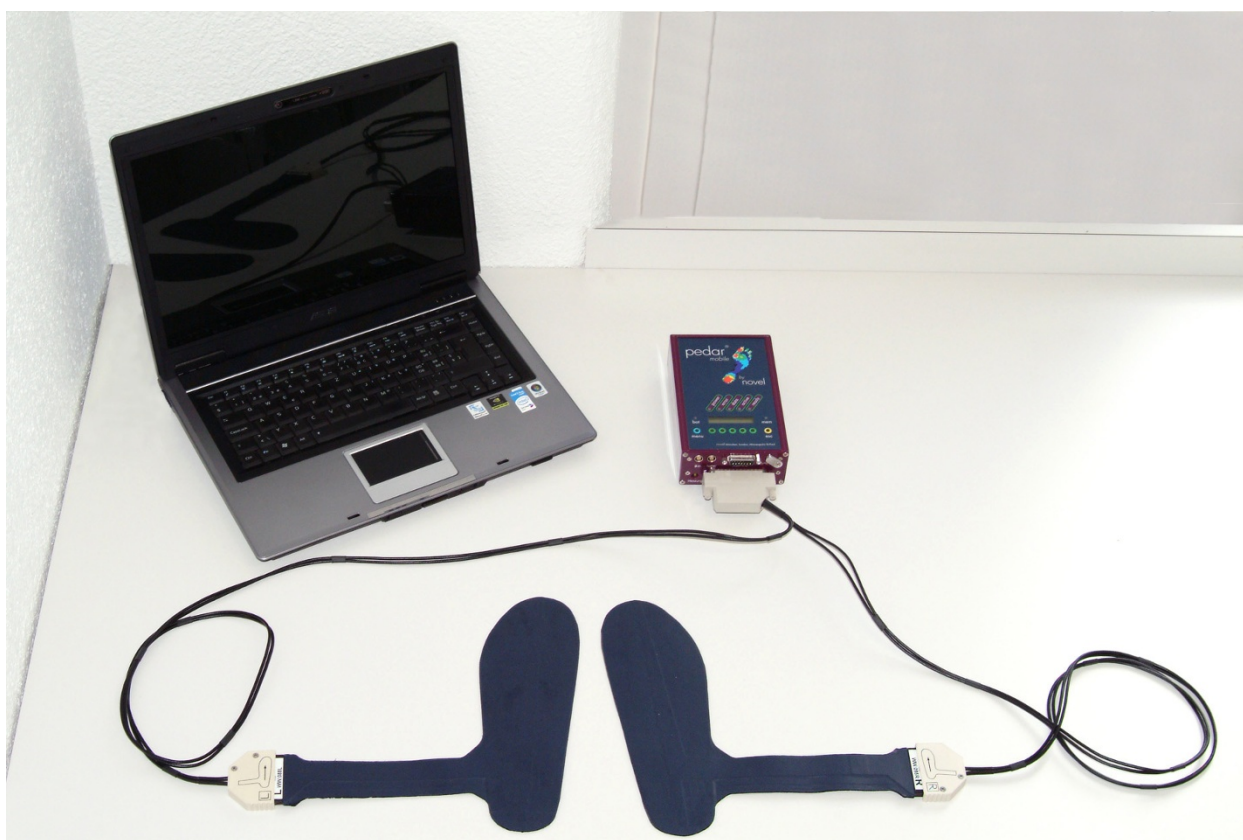
Figure 2 Pedar mobile system. Illustration of the Pedar Mobile system with the matrix insoles that are connected to the recording device. This device is further connected to a personal computer with the respective software to evaluate the measurements.

than in group 2 (55.3 years) even though this was statistically not significant ( p = 0.013 ). Several parameters of the MLS subtests showed significant differences between the two groups when tested on each side separately (Table 2). Again, when tested on both sides simultaneously, differences between the two groups became even more evident (Table 2).