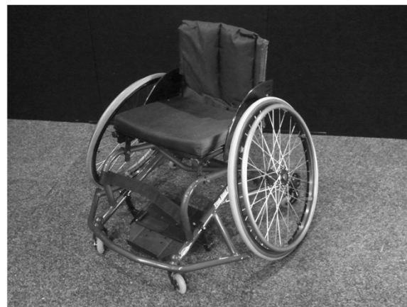
Figure 2 An example of a low point wheelchair basketball wheelchair.

Very little research has been conducted to examine performance differences in wheelchair team sports athletes of different classifications. Malone and colleagues [19] sought to determine the primary factors associated with successful free throw shooting and if these factors differed between classification groups in wheelchair basketball. All of the free throws taken at one end of the court were recorded at the 1994 Men's Gold Cup World Wheelchair Basketball Championship, with the analysis conducted on all successful clean shots. Malone et al. [19] categorised all players into one of four groups, so that there were seven clean shots for players in Group I, 16 in Group II, 18 in Group 3 and 26 in Group 4. While many significant differences were observed in the height, angle and speed of release as well as joint kinematics between the groups, tournament statistics indicated that the free throw shooting percentages were very similar across all groups, with the highest percentages being for Group 4 (54%) and the lowest for Group 3 (49%). Based on these results, Malone et al. [19] suggested that the higher classification players did not utilise their theoretical advantages in free throw