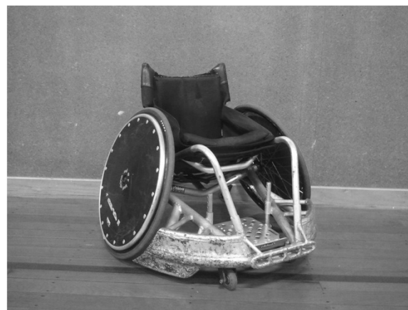
Figure 4 An example of a low point wheelchair rugby wheelchair.

A low seat angle achieved by increasing the wheel camber, as shown by the wheelchair in Figure 4, may also provide advantages for low point players in wheelchair basketball and rugby. Increasing the camber of the wheels will broaden the wheelchair's base of support,