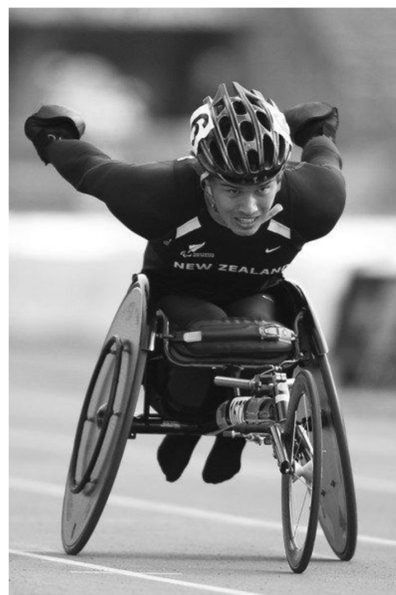
Figure 5 An example of a class T54 wheelchair racer.

Unsurprisingly, a number of studies [4,6,34,35] have indicated that many kinematic and kinetic measures