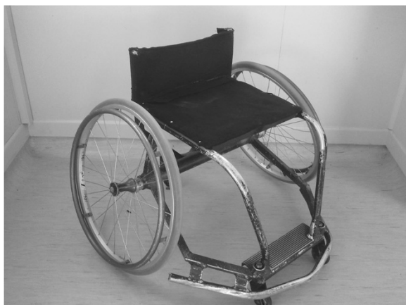
Figure 3 An example of a high point wheelchair basketball wheelchair.

shooting so that they underperformed in comparison to their lower point colleagues.