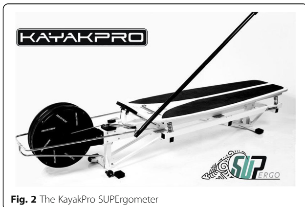
Fig. 2 The KayakPro SUPergometer

All statistical analyses were completed using the IBM Statistical Package for the Social Sciences (SPSS, Version 20.0) software program (mean \pm SD) comparing initial test, pre and post testing for the groups. Normality was assessed via Shapiro-Wilk ( P < 0.05 ) and visual inspection of the data's histogram and tests of sphericity were also performed to ensure minimising type 1 errors. Peak Speed, stroke rate, anaerobic peak speed and anaerobic distance covered were deemed to not be a normally distributed, therefore a Friedman Test was utilised with a post hoc Wilcoxon Signed Ranks test was utilised. All other data was deemed to be normally distributed and therefore a repeated measure ANOVA was utilised with a Bonferonni adjustment for multiple comparisons