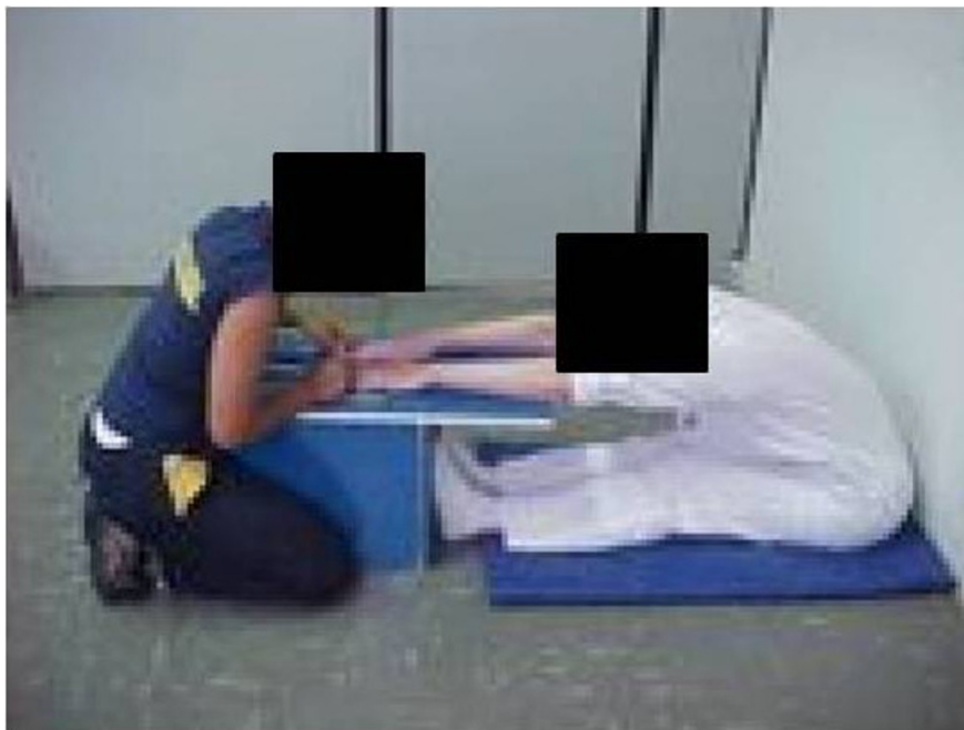
Figure 2 Bank of Wells test.

We may observe in Table 2 the correlation between the movements of the hip (abduction and flexion, right